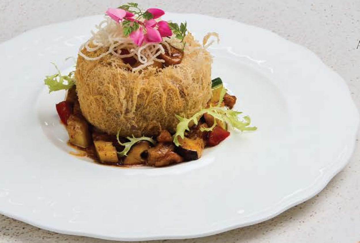
芋砵飘香 Assorted Vegetables served in Yam Ring $ 26