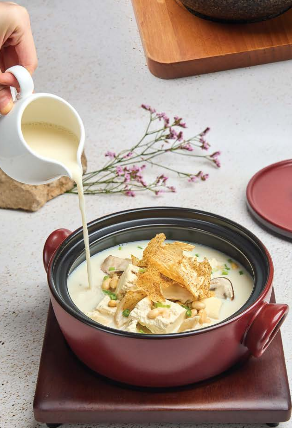
姬松茸炖豆腐 Stewed Himematsutake Mushroom with Tofu $ 26.8