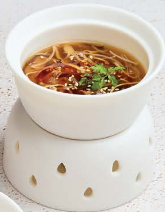
四川酸辣汤 Hot and Sour Soup $ 10 (每位/per person)