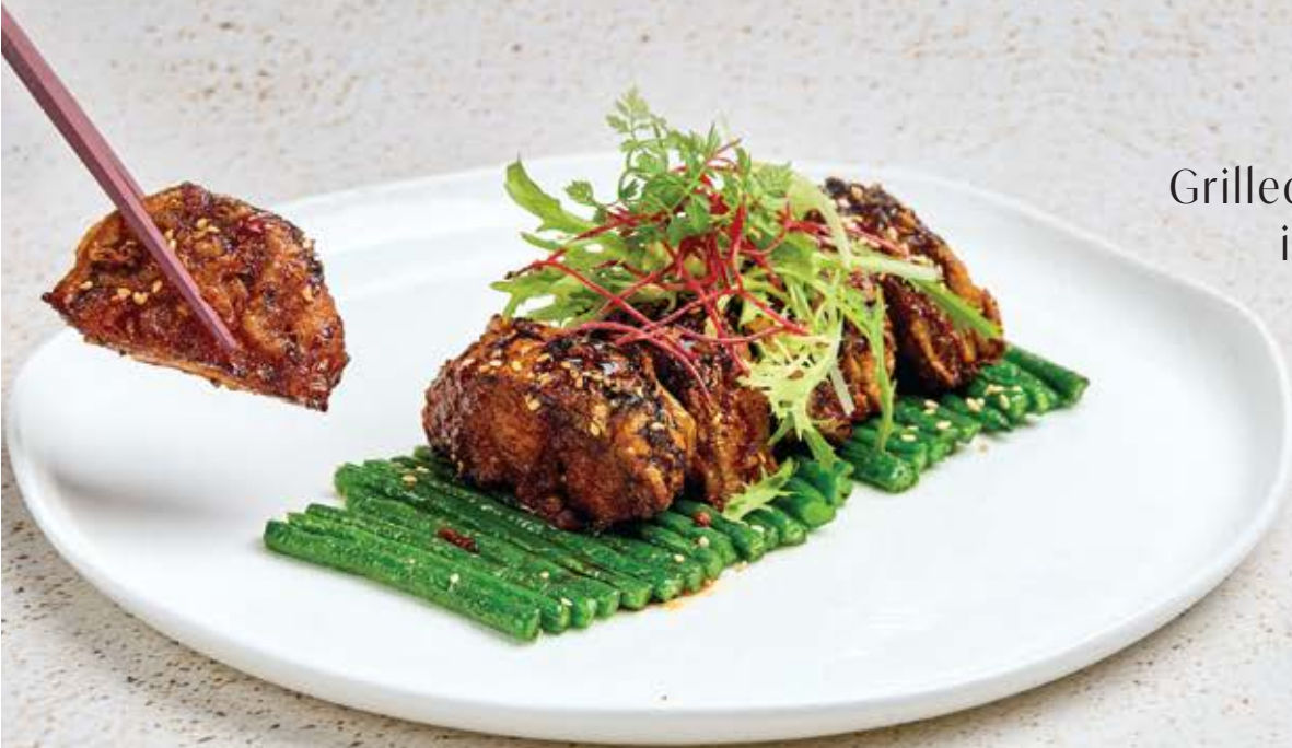
香麻烤素珍 Grilled Plant-based Treasures in Signature Sauce $ 26 (6片/pcs)