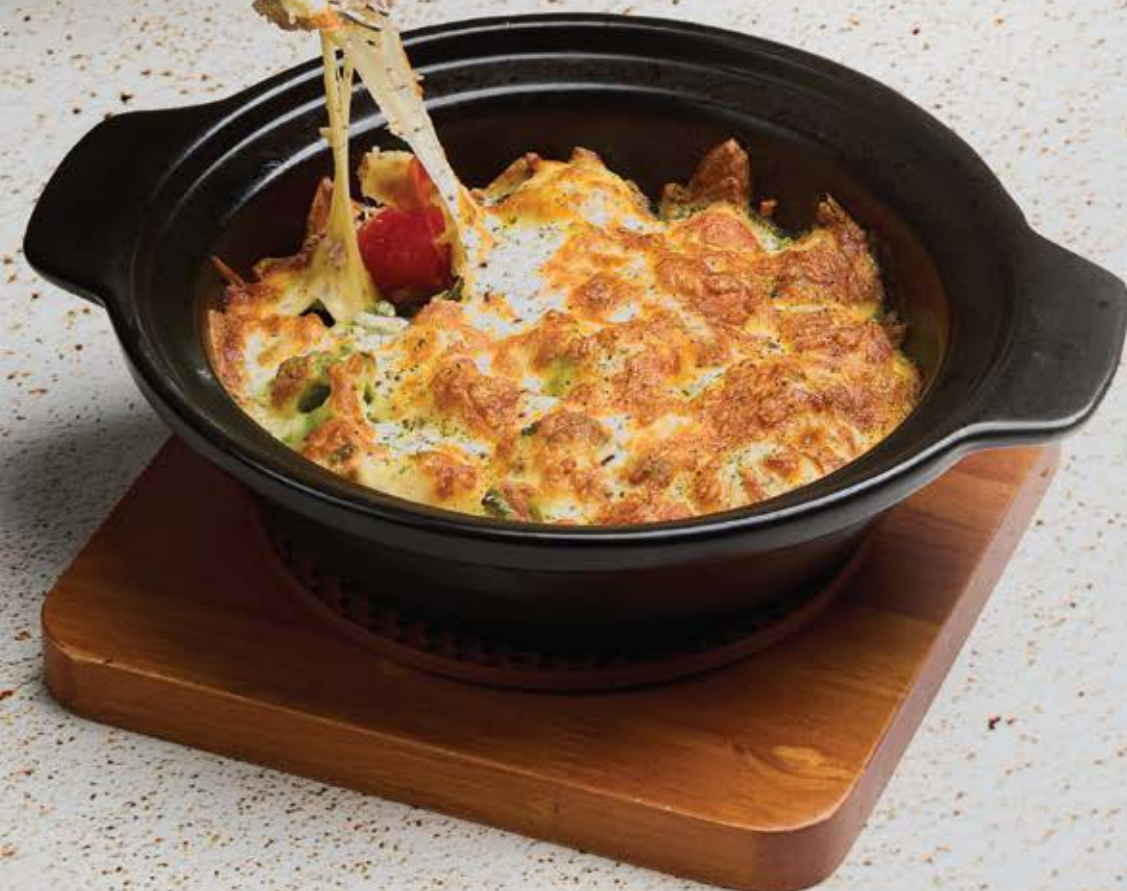
芝士焗时蔬 Baked Seasonal Vegetables with Cheese $ 26.8