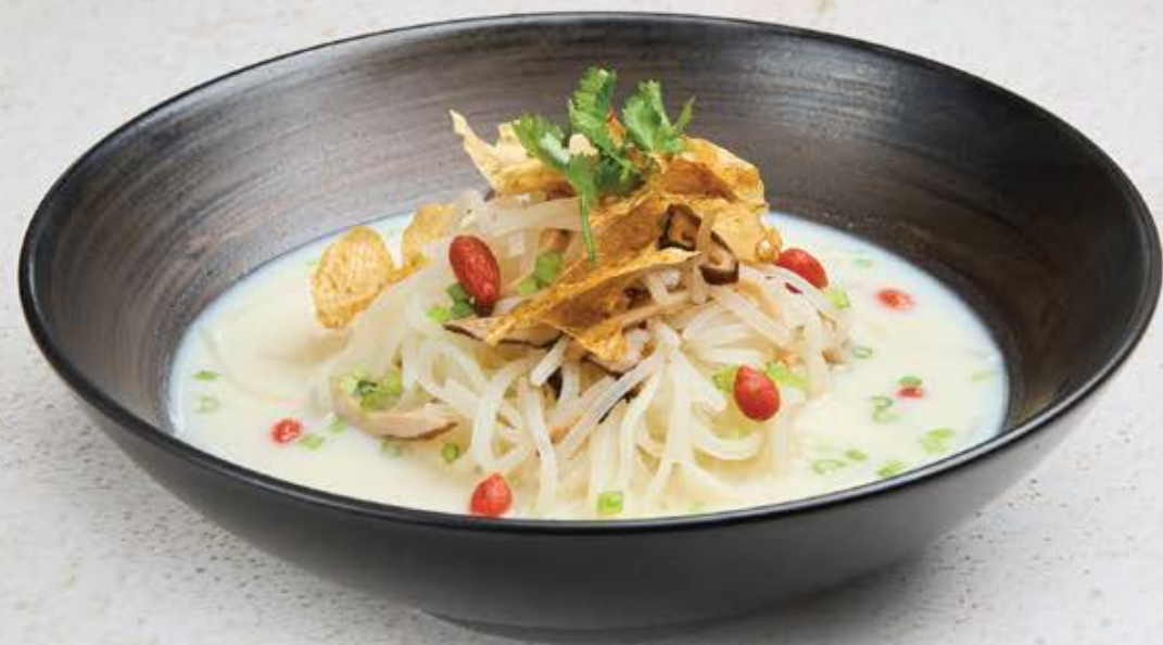
赛人参 Radish with Ginseng, Bamboo Shoots and Mushroom $ 22