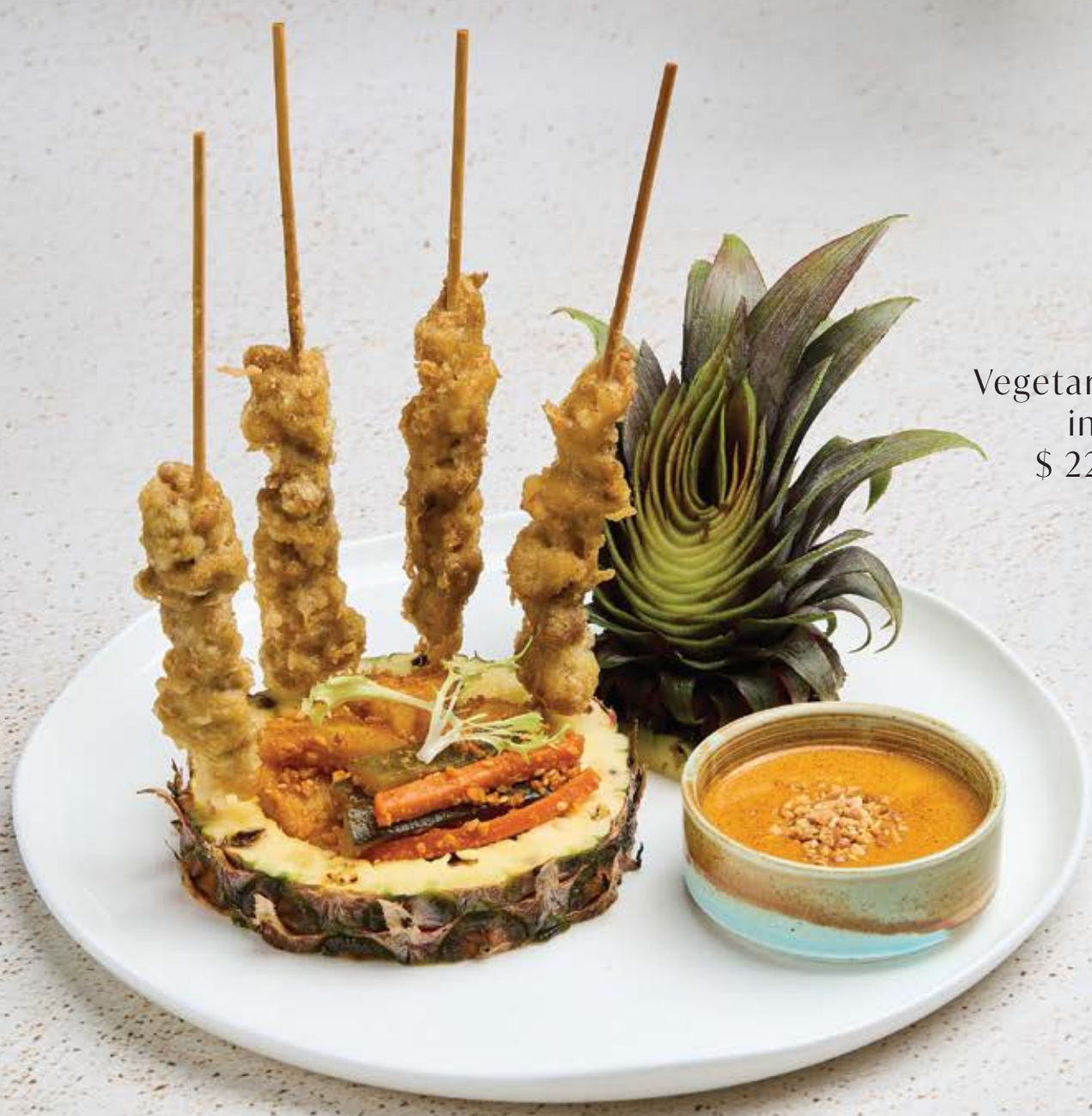
金枝玉叶 Vegetarian Satay served in Pineapple $ 22 (4 支/sticks)