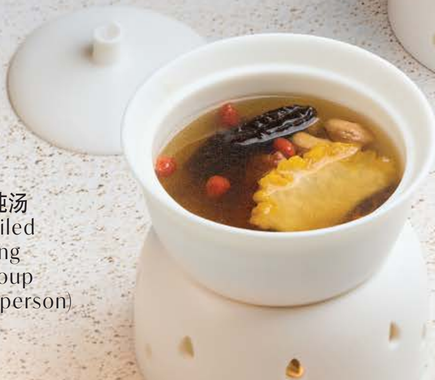
灵芝养颜炖汤 Double-boiled Nourishing Ling Zhi Soup $ 14 (每位/per person)