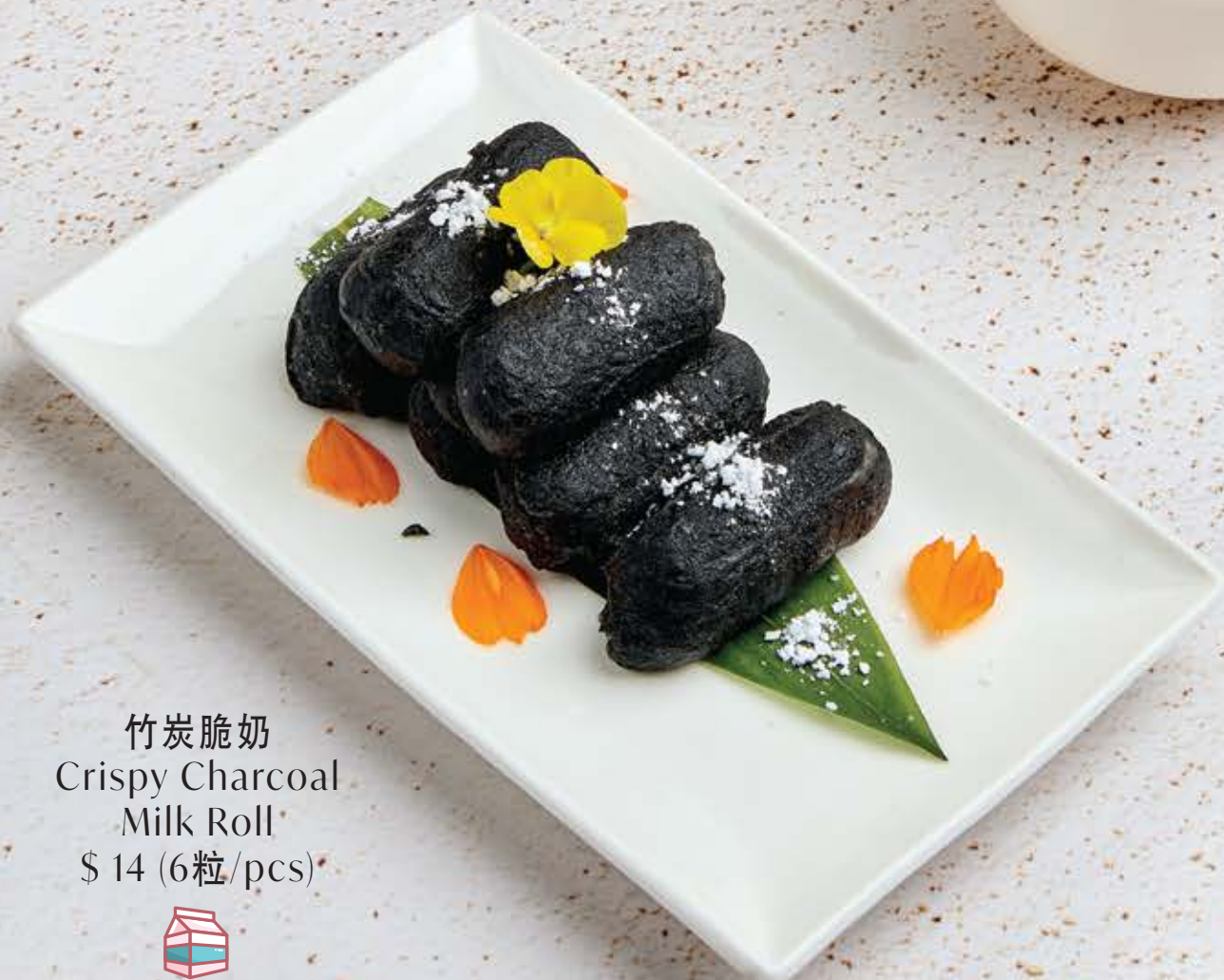
竹炭脆奶 Crispy Charcoal Milk Roll $ 14 (6粒/pcs)