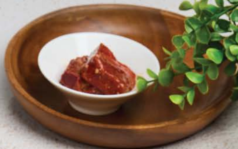
南乳香芋粉丝煲 Braised Yam and Vermicelli with Fermented Beancurd Sauce served in Claypot $ 22