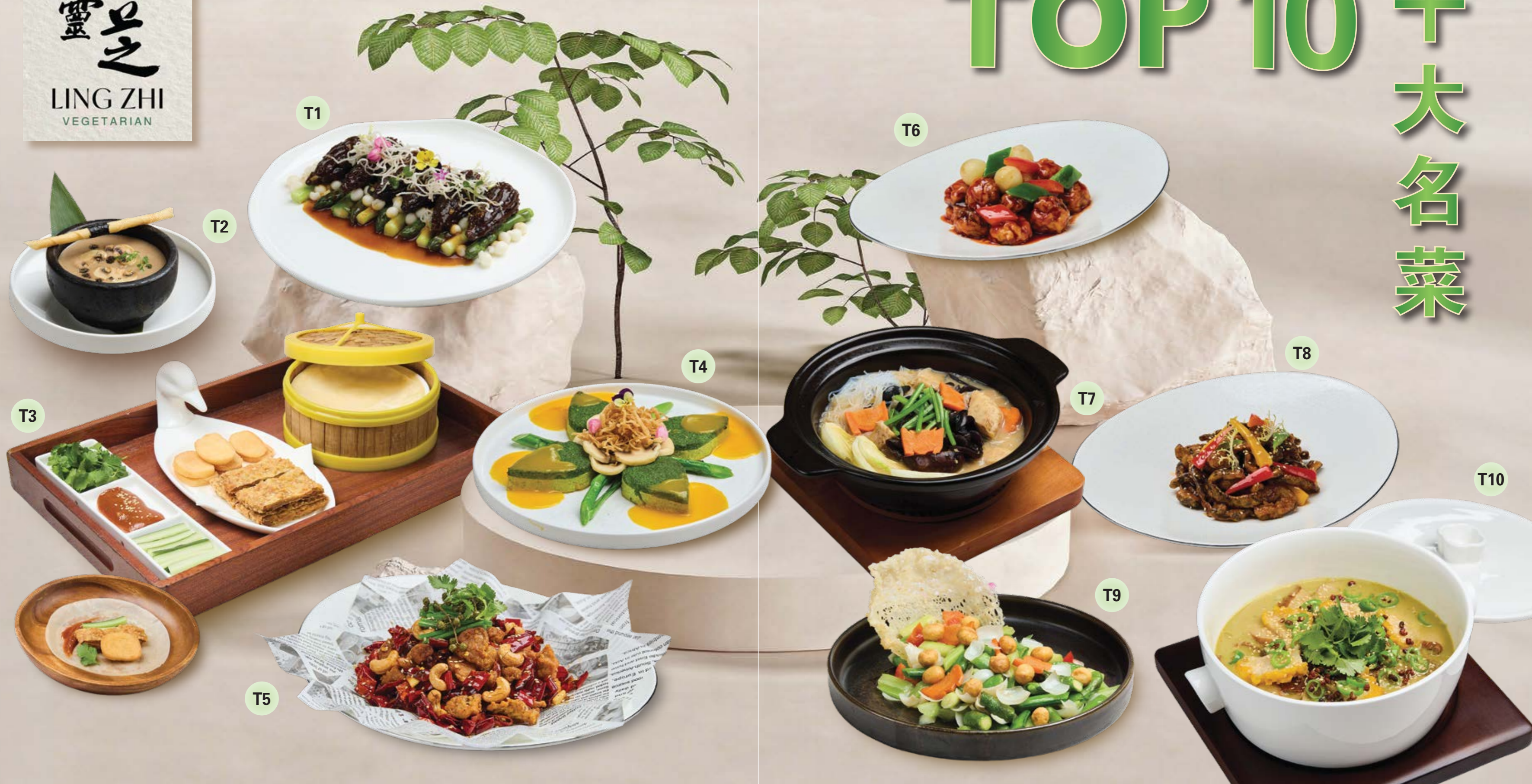
T1 三杯煎酿羊肚菌 $38.8 Pan-fried Stuffed Morel Mushroom with 'San Bei' Sauce