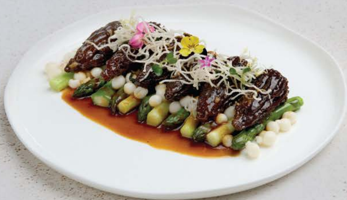
三杯煎酿羊肚菌 Pan-fried Stuffed Morel Mushroom with 'San Bei' Sauce $ 38.8