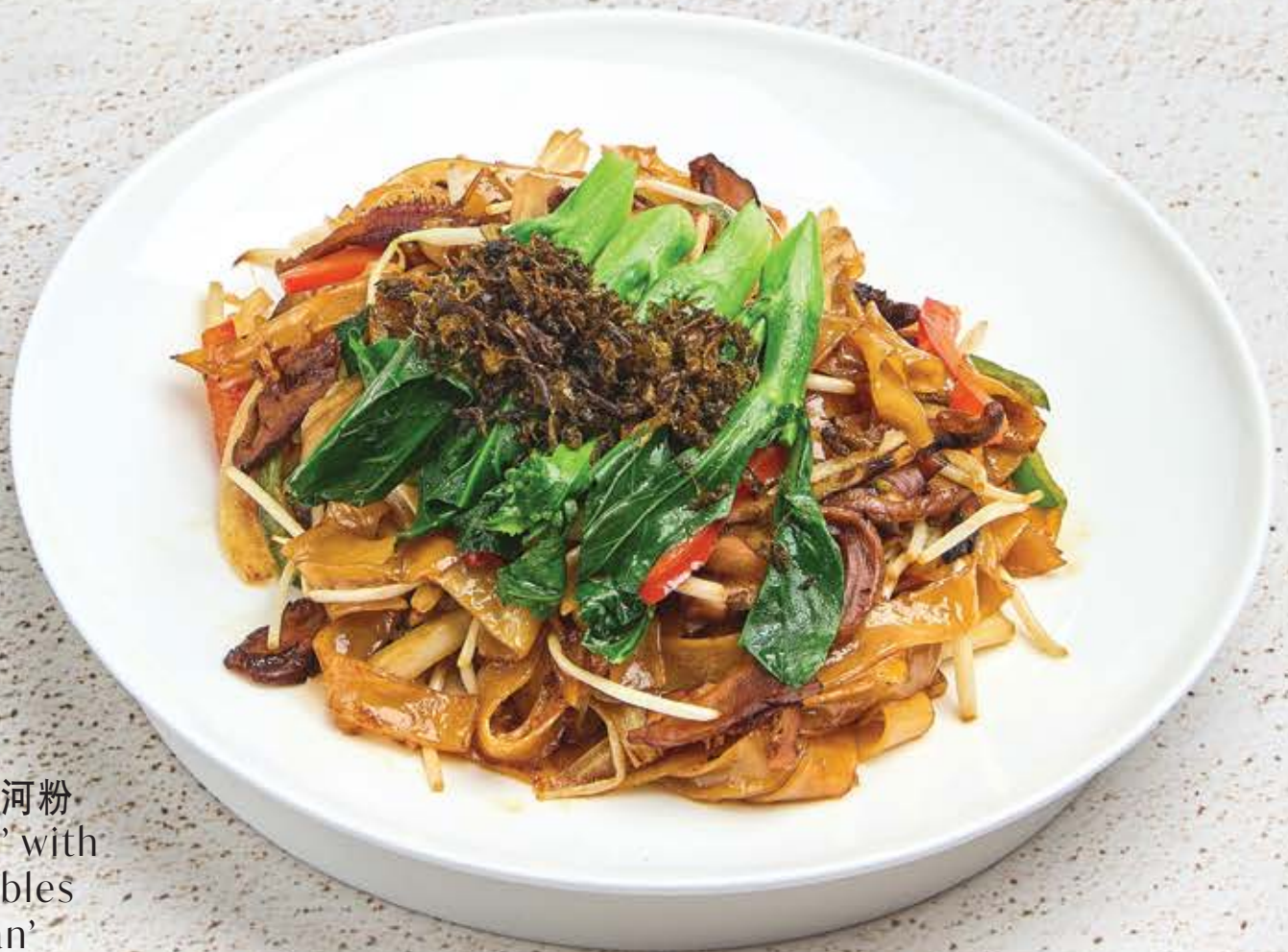
榄菜芥兰干炒河粉 Fried 'Hor Fun' with Olive Vegetables and 'Kai-Lan' $ 18