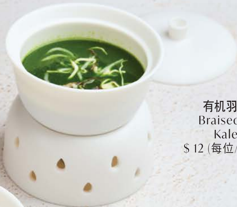
有机羽衣甘蓝羹 Braised Organic Kale Broth $ 12 (每位/per person)