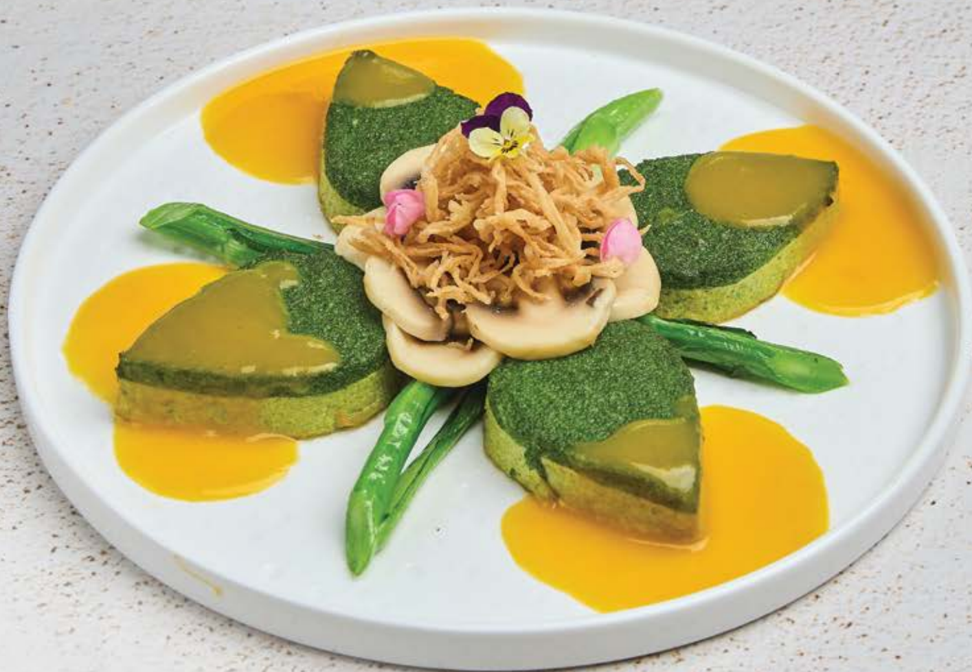
翡翠豆腐 Homemade Beancurd topped with Fresh Mushroom $ 24 (4件/pcs)