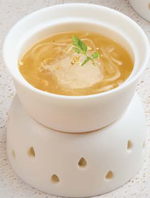
金箔冬茸燕窝羹 Braised Bird's Nest and Winter Melon topped with Bamboo Shoot $ 30 (每位/per person)