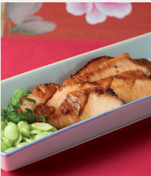
Char-grilled Kurobuta Pork Jowl