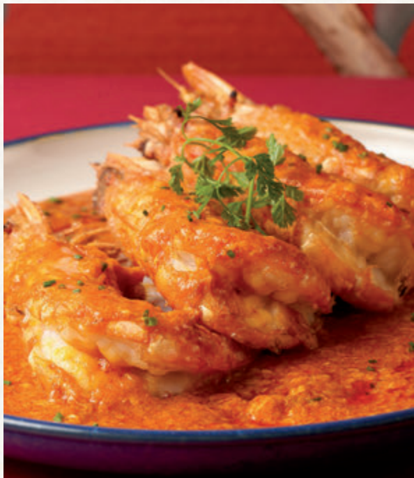
Singapore-style Chilli King Prawn