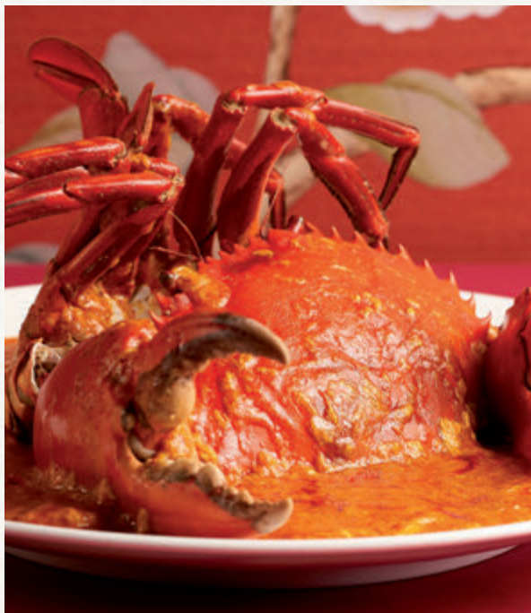
Singapore-style Chilli Crab