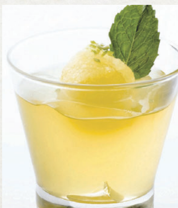
Chilled Lemongrass Gelo with Aloe Vera topped with Yuzu Sorbet