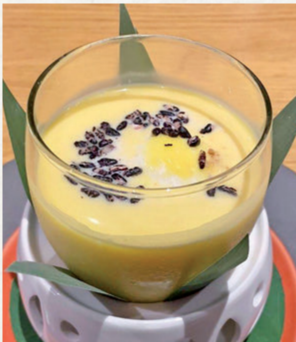
Chilled Pumpkin Purée topped with Purple Rice and Coconut Ice-cream