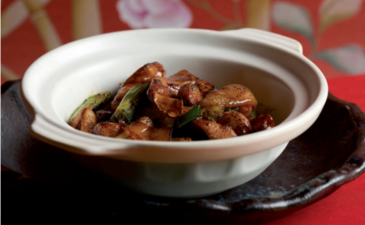
Braised Chicken with Garlic and Basil in Sesame Oil