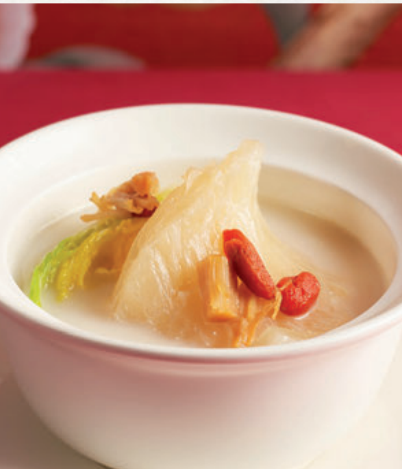
Double-boiled Superior Fish Bone Soup with Fish Maw