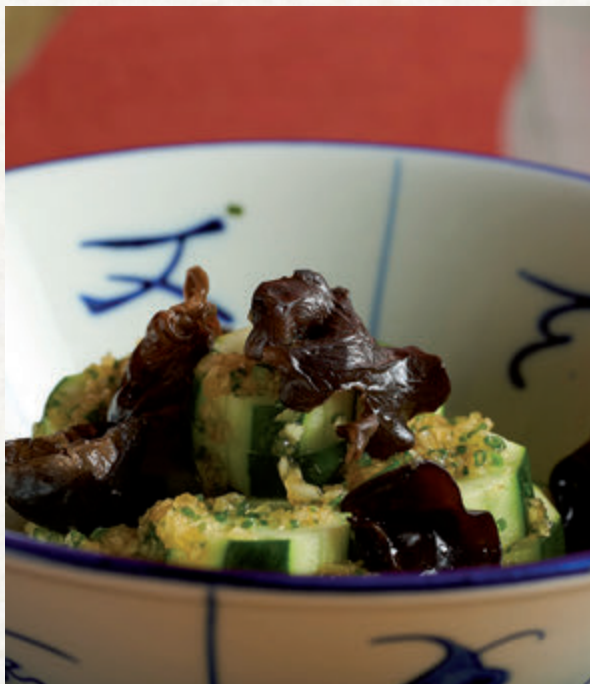
Beijing-style Appetising Japanese Cucumber and Black Fungus