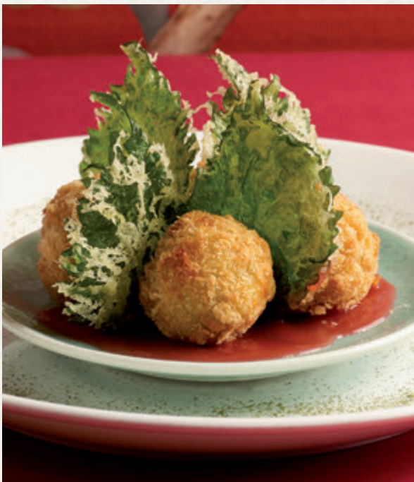
Deep-fried Crab Croquette stuffed with Cheese and Béchamel Sauce