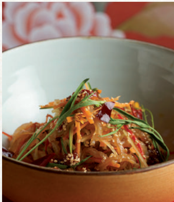
Thai-style Chilled marinated Jellyfish