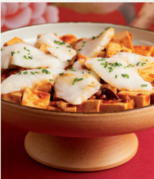
Braised Beancurd with Sliced Fish in Sichuan Spicy Sauce