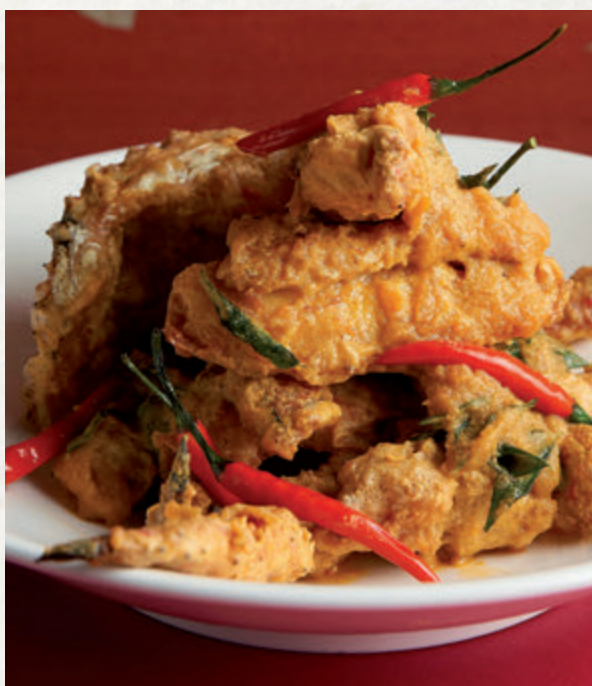
Wok-fried Crab with Salted Egg Yolk