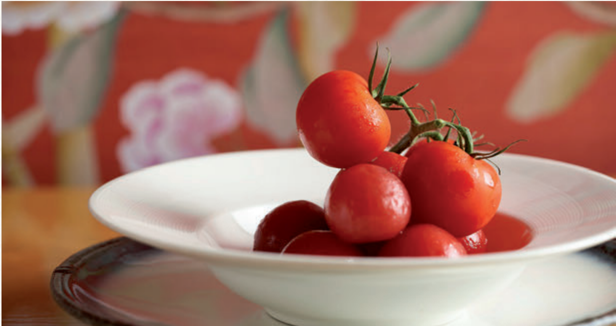
Chilled marinated Cherry Tomato