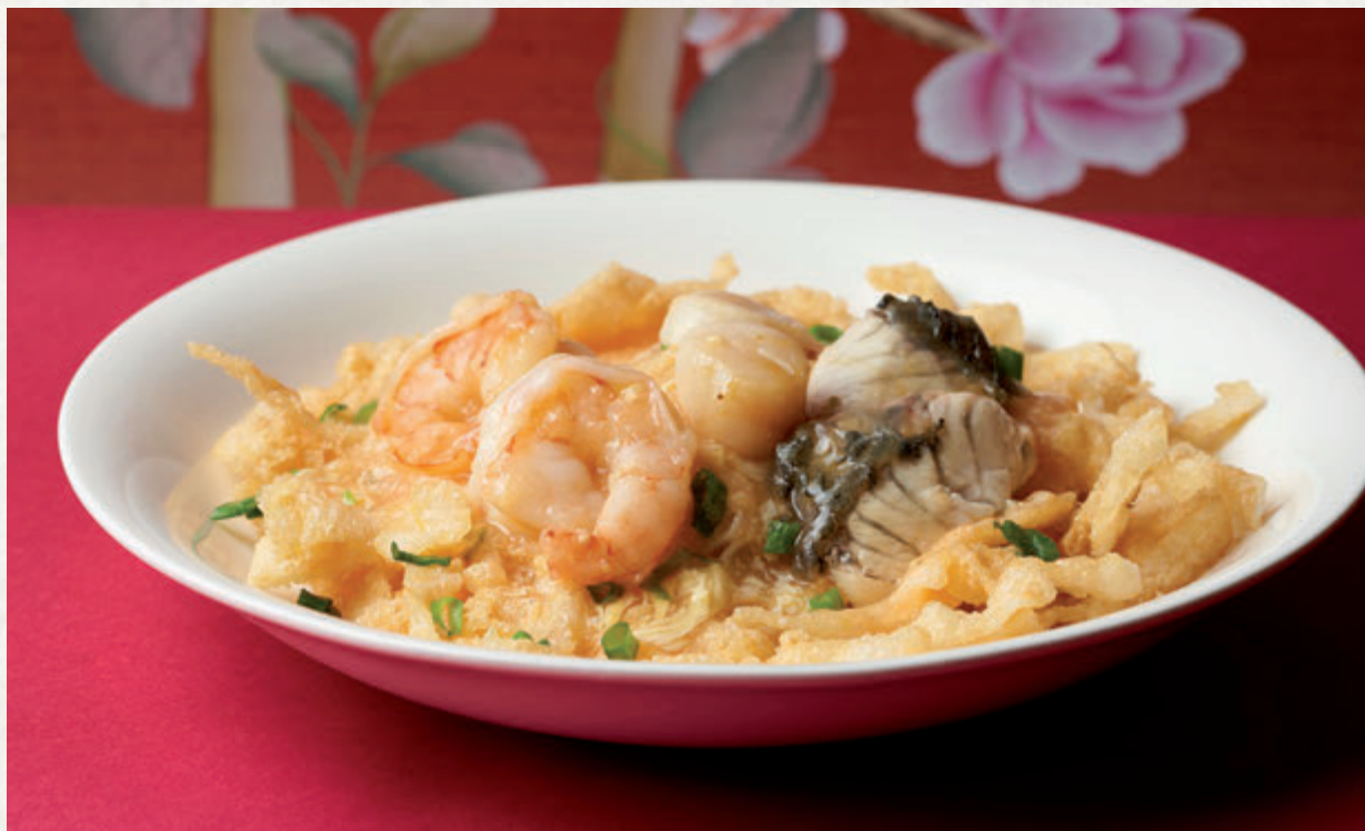
Wok-fried 'Hor Fun' with Seafood in Egg Gravy topped with Crispy 'Hor Fun'