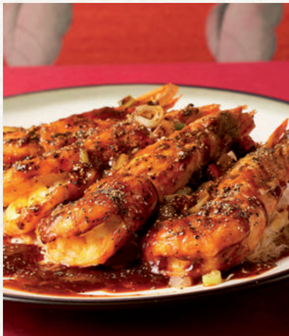
Braised King Prawn with Black Peppercorn