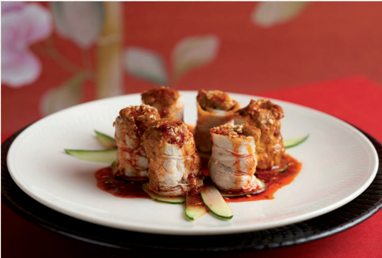
Sichuan-style Sliced Pork with Minced Garlic and 'Mala' Sauce