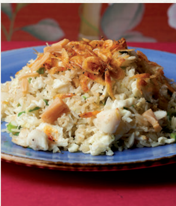
Wok-fried Fragrant Rice with Seafood and Sakura Ebi