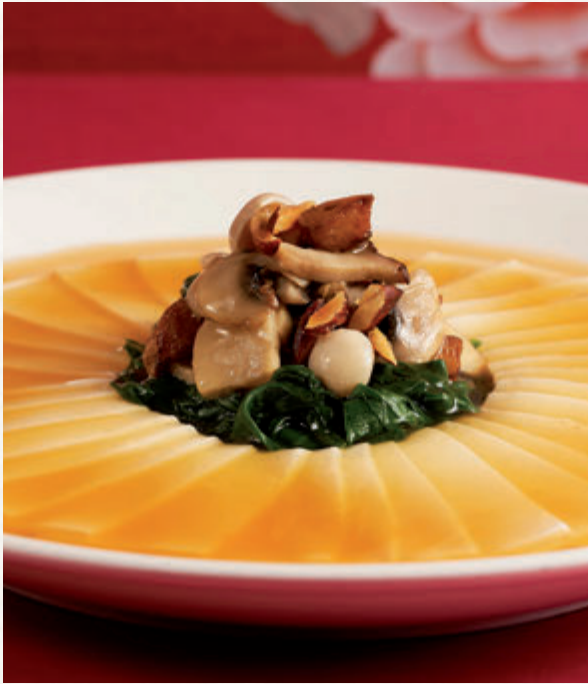
Braised Beancurd with Fresh Greens and Wild Mushroom