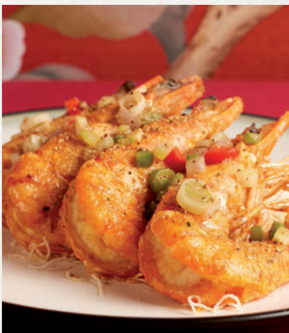
Braised King Prawn with White Peppercorn