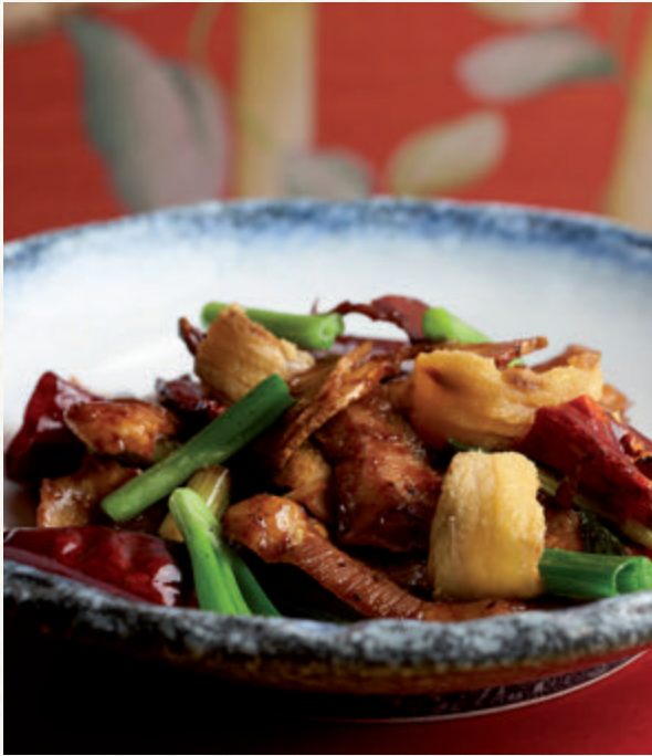
Braised Kurobuta Pork Jowl with Salted Fish