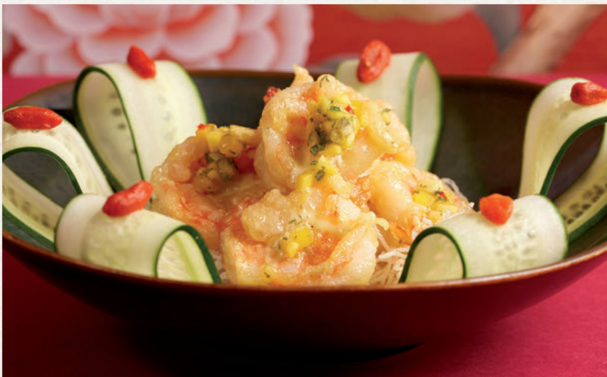
Deep-fried De-shelled Prawn coated with Wasabi-mayo Sauce