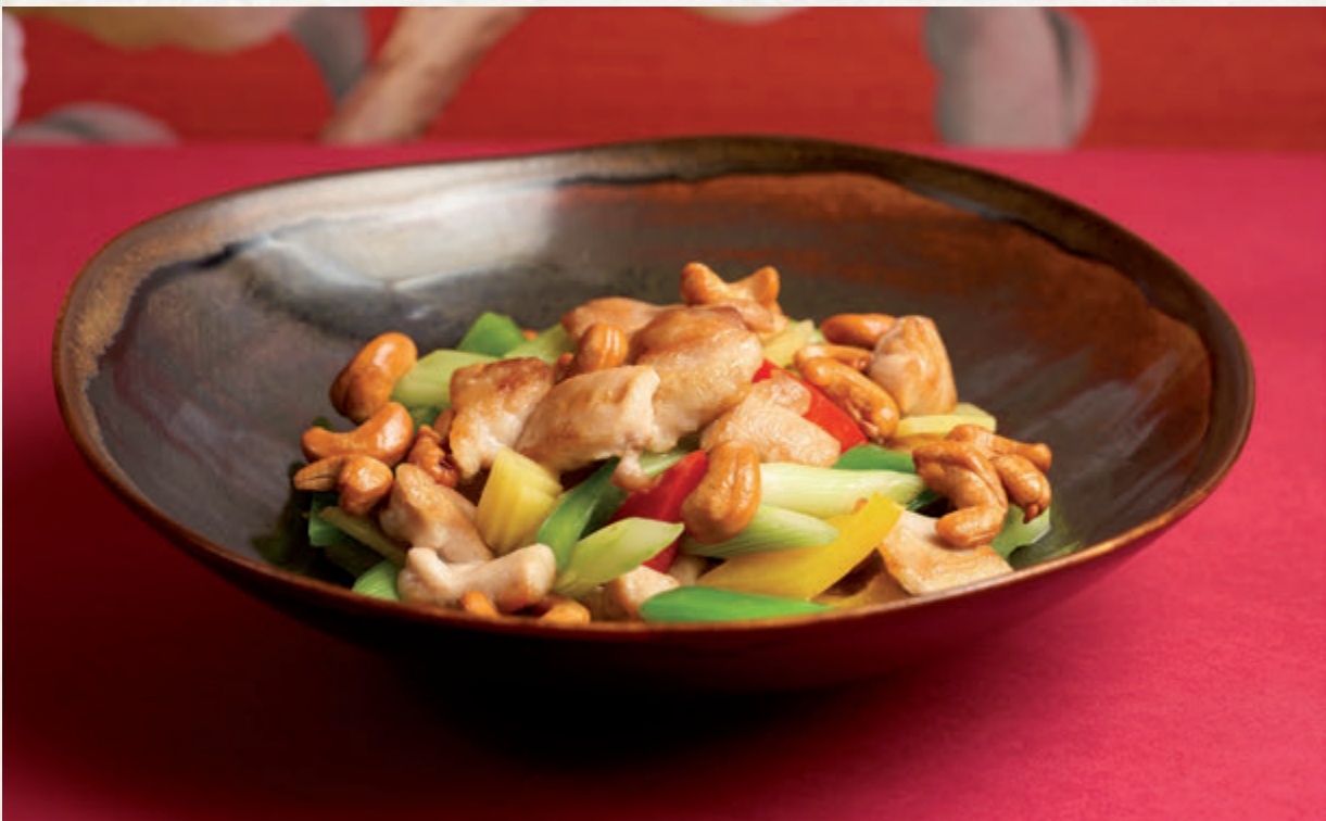
Stir-fried Chicken with Cashew Nut