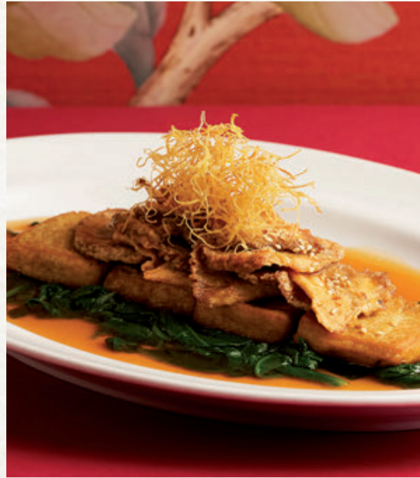
Homemade Beancurd with Monkey Head Mushroom