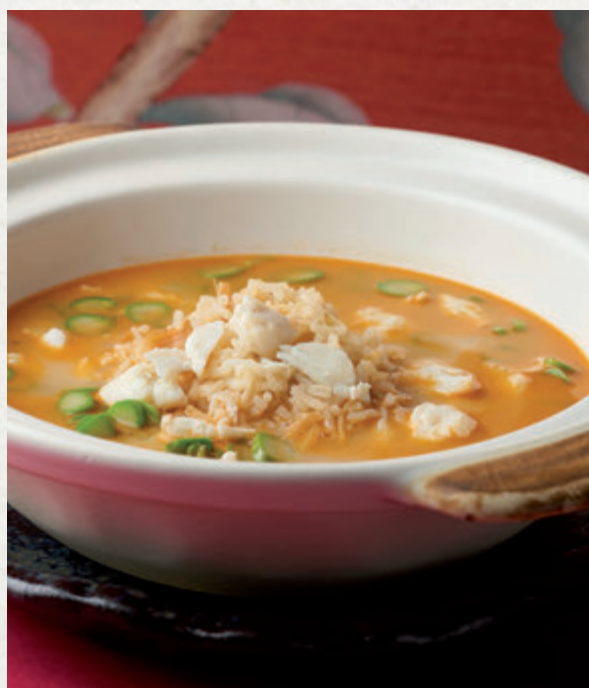
Poached Crispy Rice with Freshly-peeled Crab Meat in Superior Broth