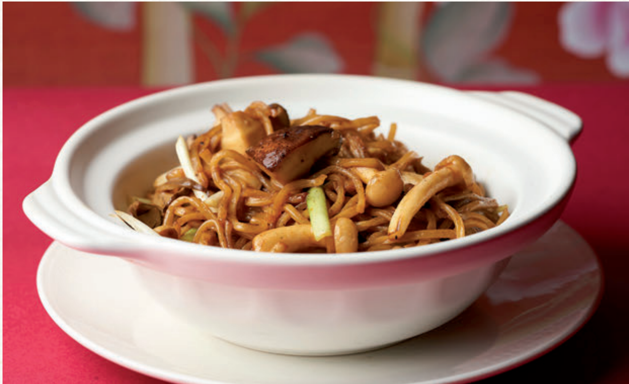
Braised 'Ee-fu' Noodles with Wild Mushroom