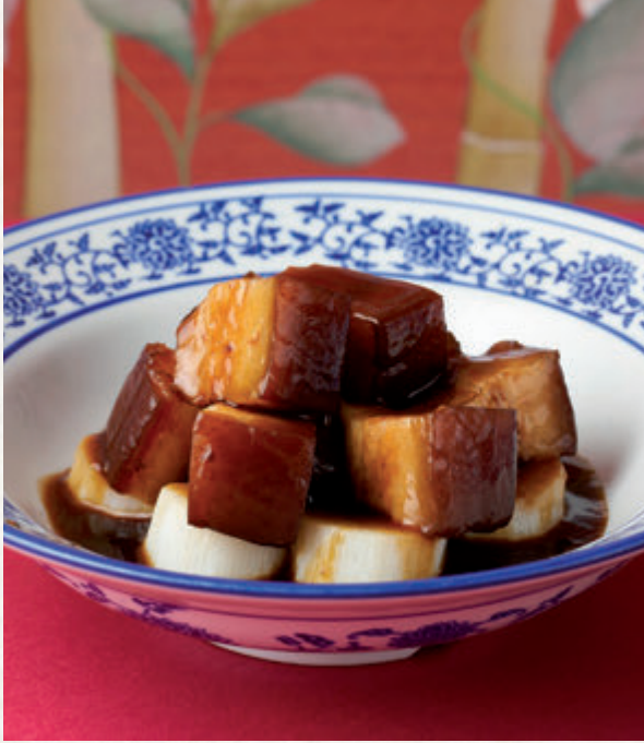
Braised 'Dong Po' Pork Belly