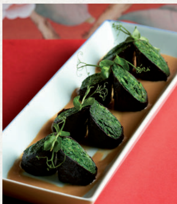
Australian Spinach with Sesame Sauce