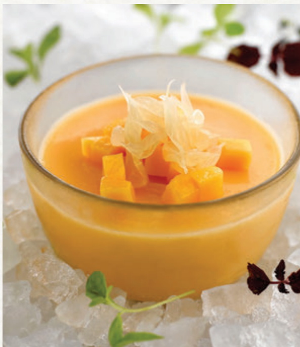
Chilled Mango Cream with Pomelo and Sago