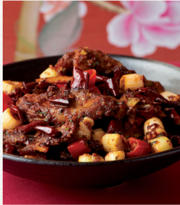
Sautéed Kurobuta Pork Jowl with 'Mala' Sauce