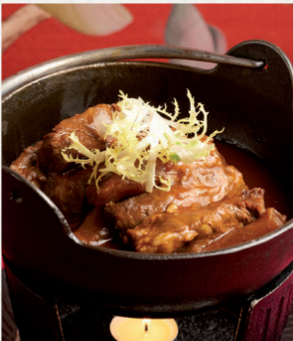
Stewed Beef Tendon and Beef Brisket in Bean Paste