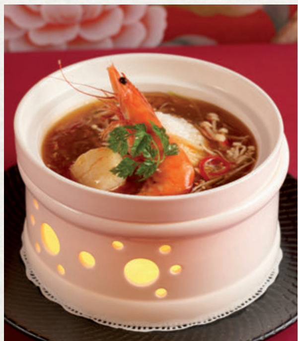
Hot and Sour Soup with Assorted Seafood