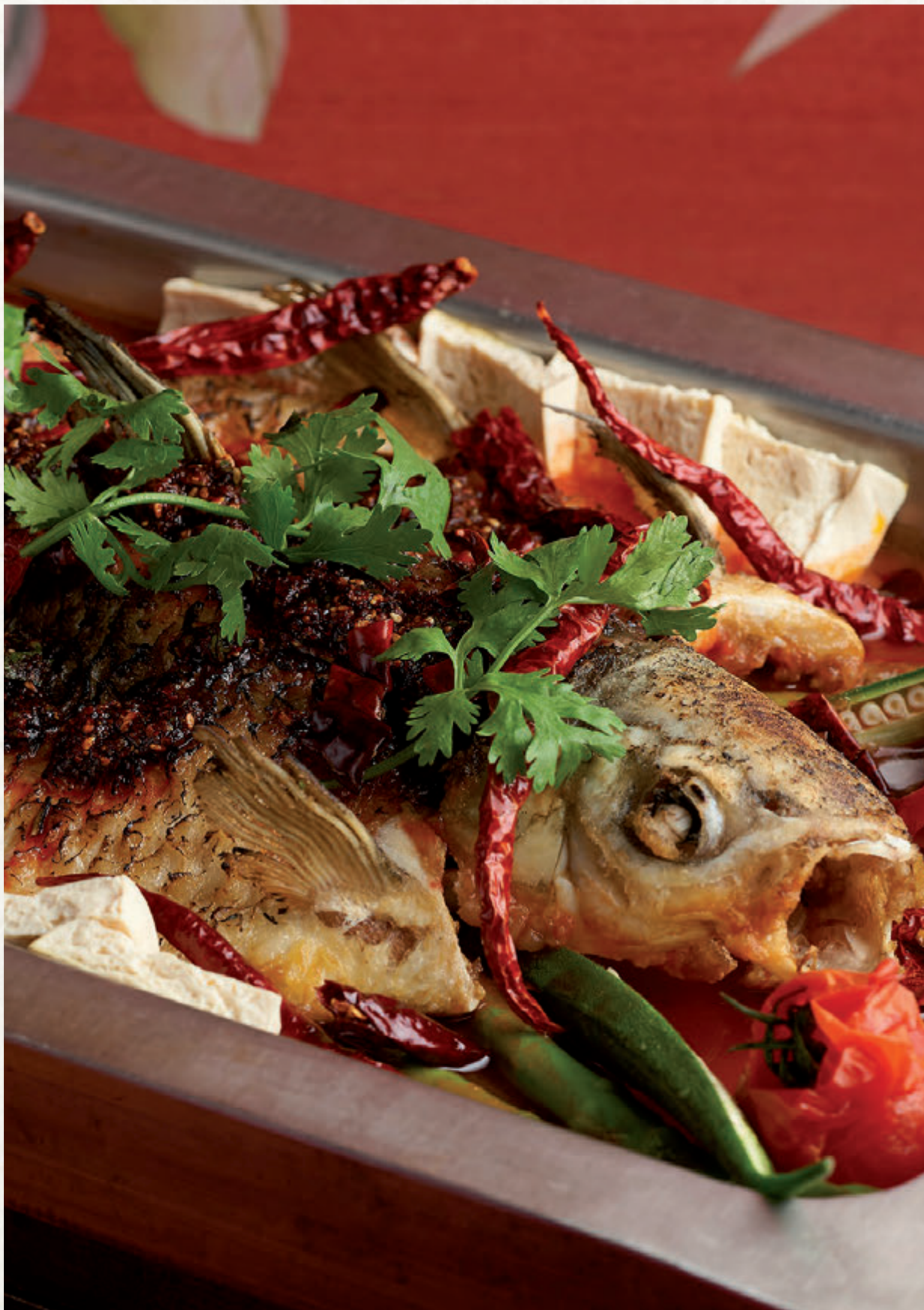
Grilled Fish with Mala' Sauce