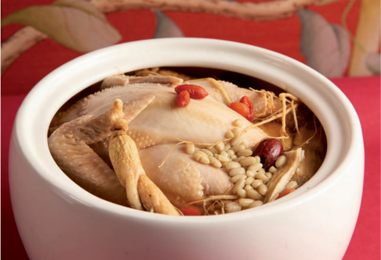
Double-boiled Ginseng Chicken Soup with Nepalese Rock Grains