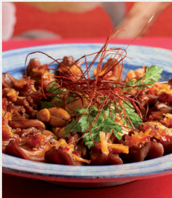
Stewed Duck Tongue with X.O. Chilli Sauce