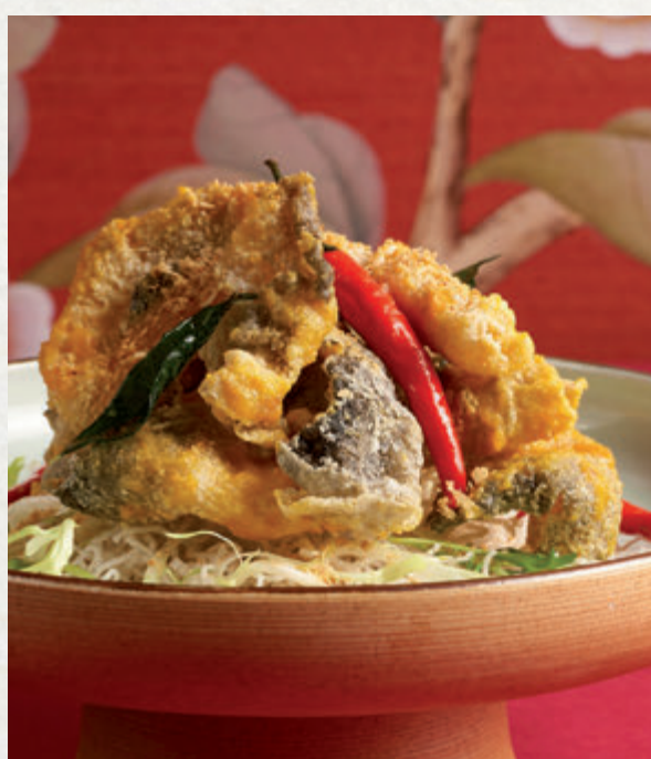
Crispy Fish Skin coated with Salted Egg Yolk