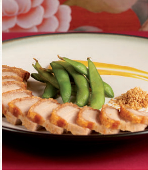
Honey-glazed Crispy Pork Belly with Vinaigrette