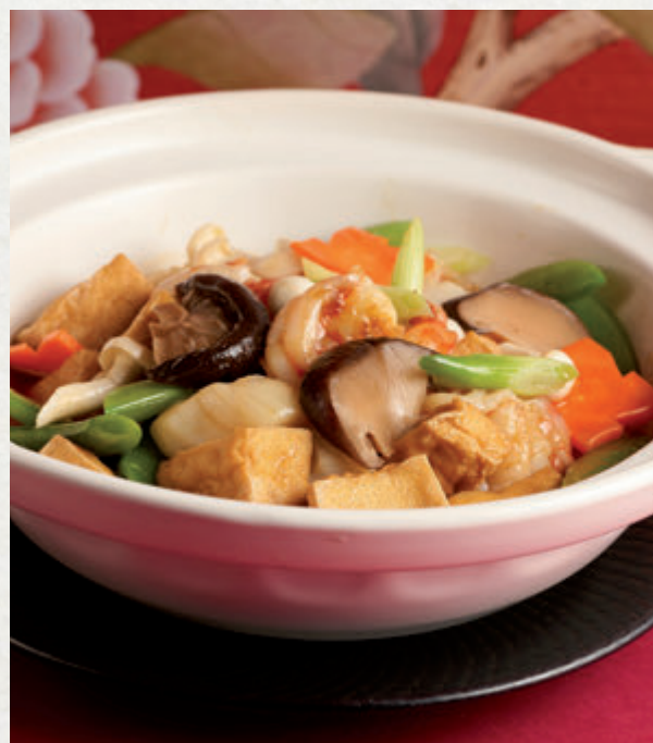
Braised Beancurd with Seafood in Claypot