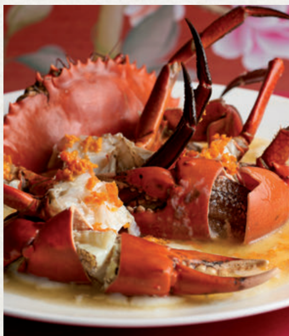
Steamed Crab with Egg White and Chinese Wine