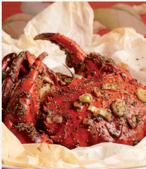
Braised Crab with Black Peppercorn