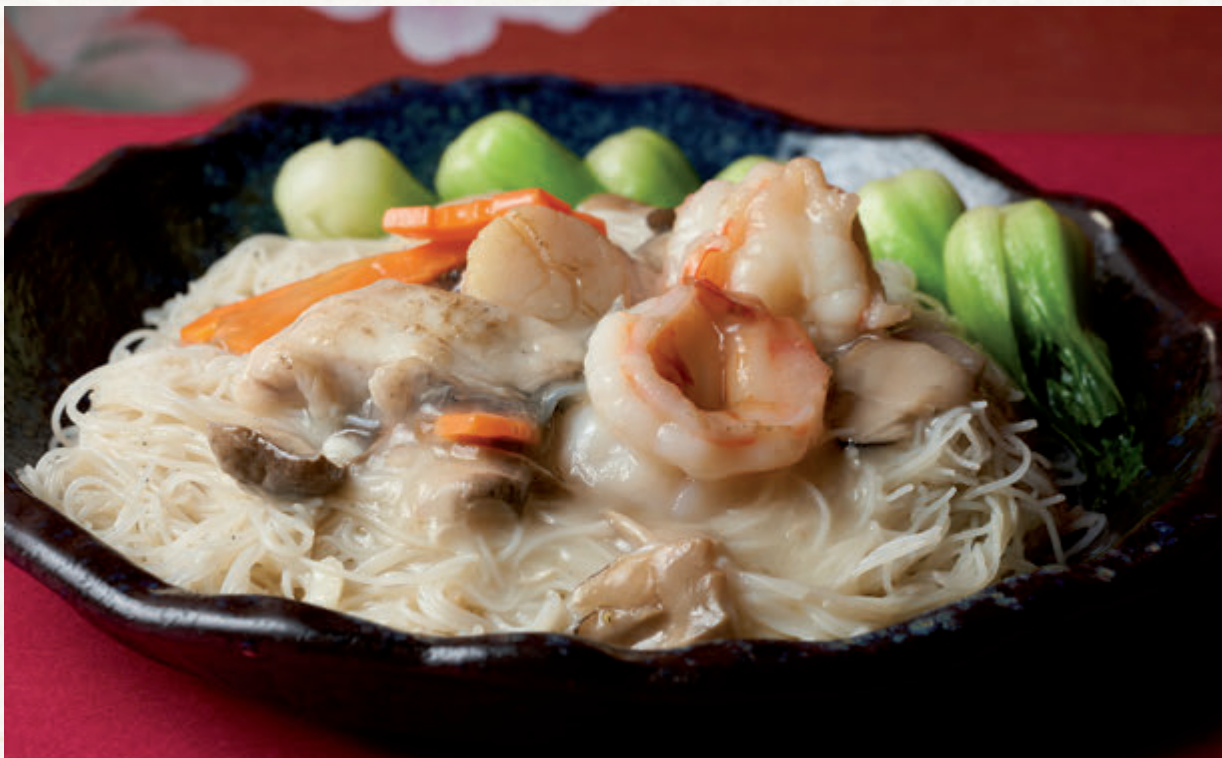
Braised Rice Vermicelli with Seafood