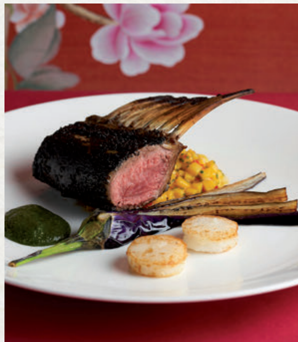
Pan-fried marinated Rack of Lamb in Asian Spice served with Fresh Chilli Mint Chutney