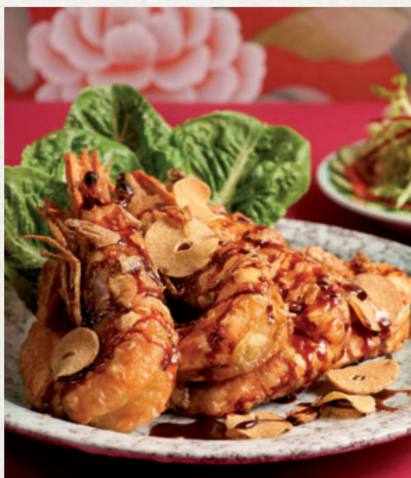
Braised King Prawn with Superior Soy Sauce