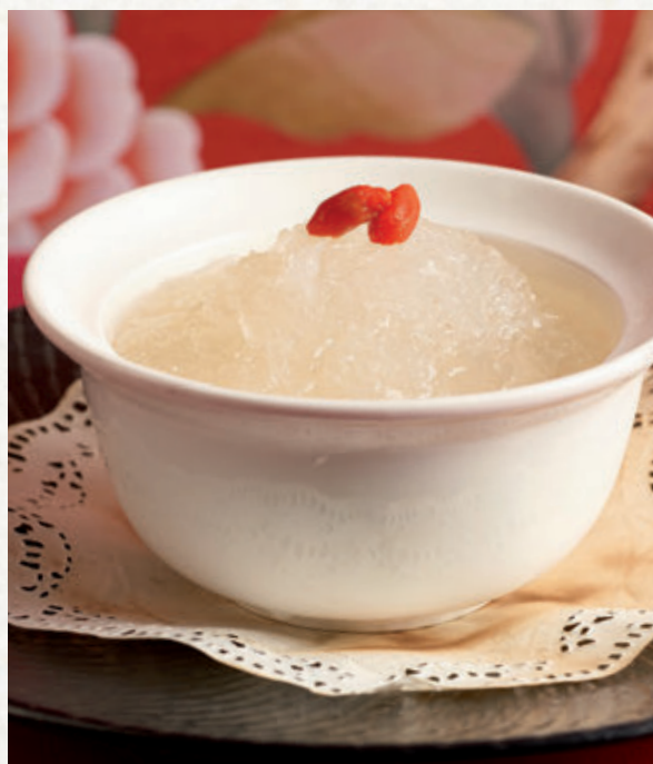
Double-boiled Bird's Nest with Rock Sugar