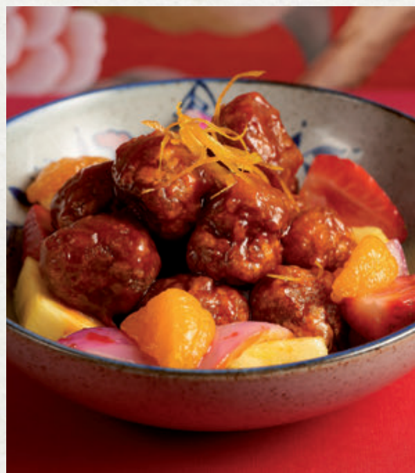
Sweet and Sour Ibérico Pork