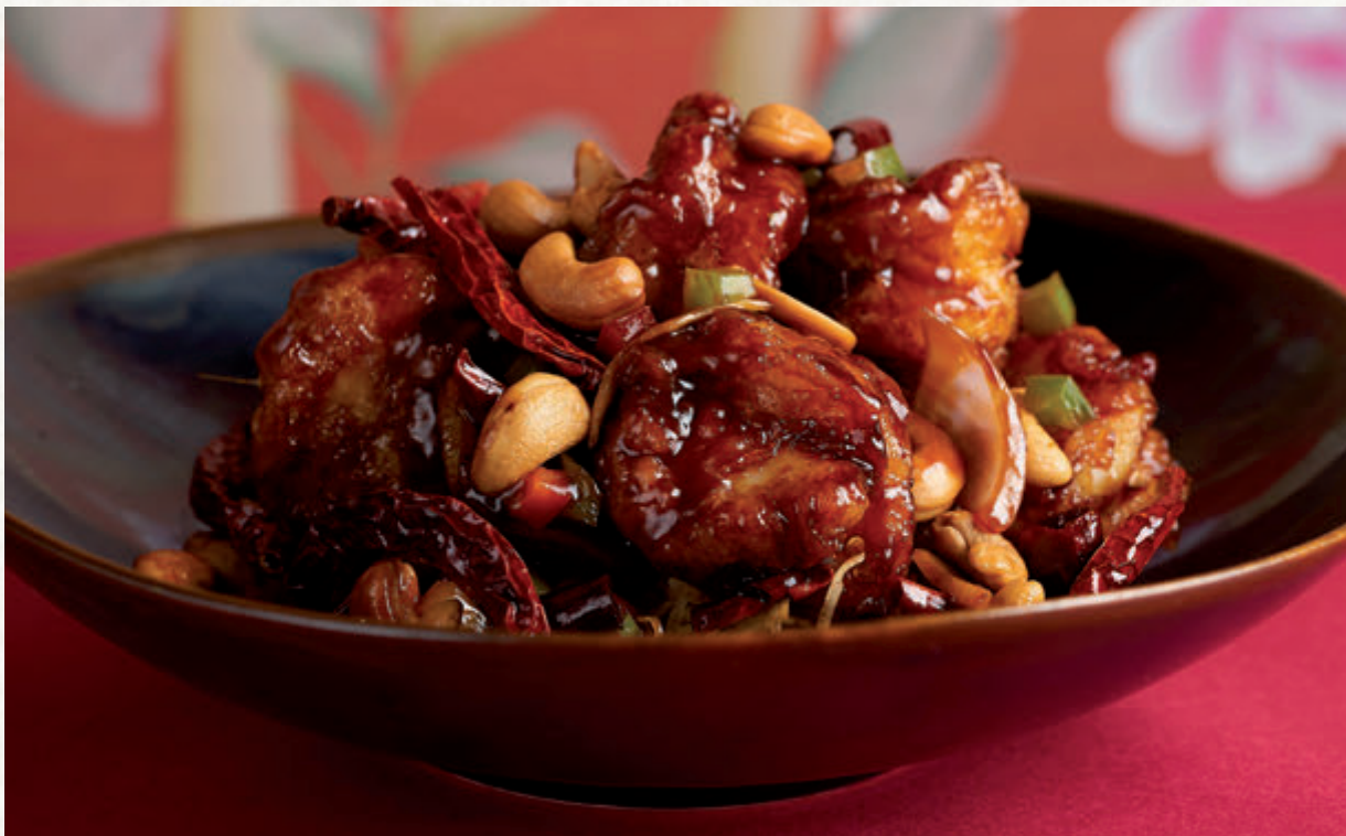
Wok-fried De-shelled Prawn with Dried Chilli and 'Mala' Sauce