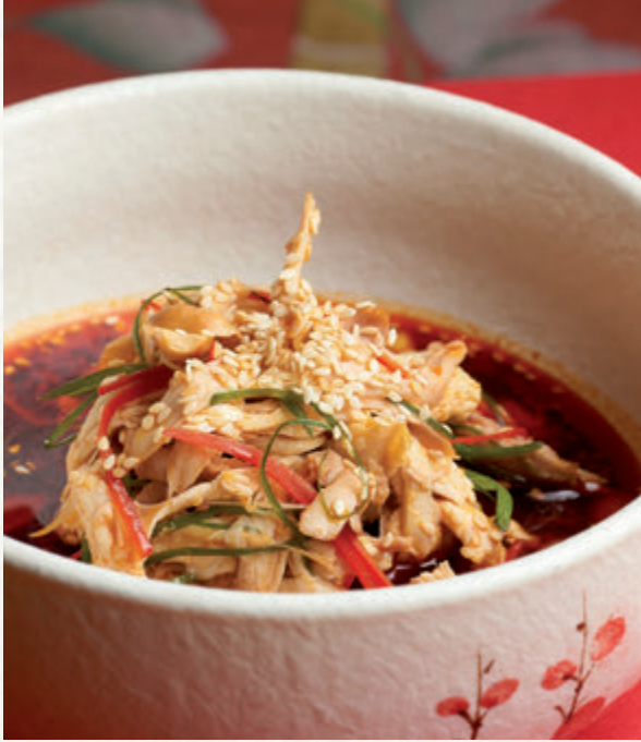
Sichuan-style Shredded Kampung Chicken in Chilli Oil